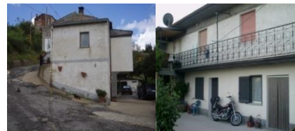
Fig.1 – Single family house.

Transparent surfaces have single glazing, the frames are made of wood. The family is composed of three people and inhabited zones are located on the first floor.