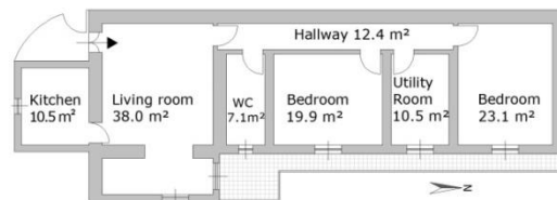
Fig. 2 – Map of the single family house.

The generator system is a wood-burning boiler fireplace and the internal air temperature is controlled by a thermostat.