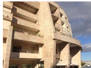
Fig. 3 – Apartment in condominium.

The second case study is an apartment of 80 m 2 , built in 2008 in reinforced concrete (see fig. 3).